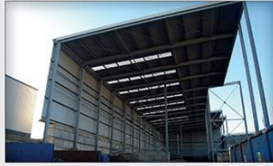
Open storage - the Netherlands