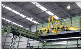
Recycling facility - the Netherlands