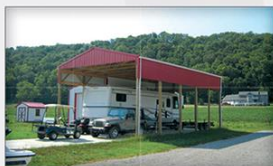
Carport - USA, Indiana