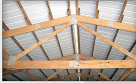
Pole Barn - USA, Indiana