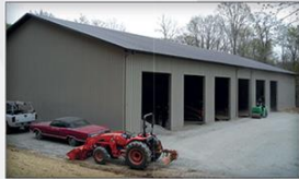
Storage - Ohio