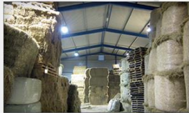
Barn - the Netherlands