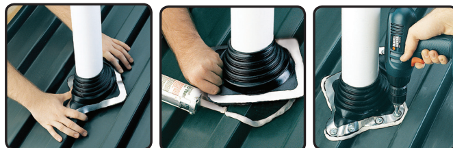
3. Form to roof profile 4. Apply sealant 5. Fasten to complete