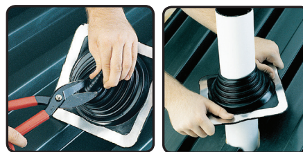
1. Choose pipe opening and trim 2. Slide over pipe